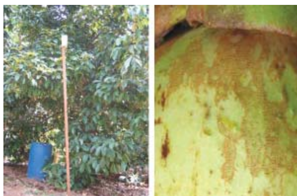
Fig. 2. Combination treatment of sanitation and yellow fluorescent sticky trap (left), and symptom of scars on mangosteen fruit (right).

damage on avocado fruit, respectively. Hasyim et al. (2003) reported that the economic injury level of thrips on citrus occurred if there was enough thrips population available in the field (e.g., 5 thrips were caught per YST). A controlling action, therefore, should be done when the population number observed in the field has reached four thrips caught per YST.