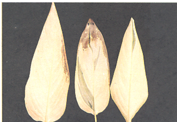
Fig. 1. Maranta arundinacea plant showing bacterial leaf blight symptoms (left). Left-natural infection; middle-carborundum inoculation, right-healthy leaves (right).